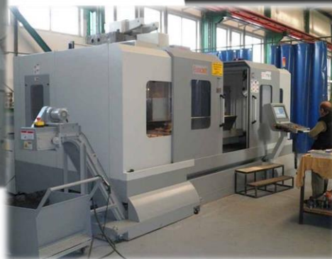
EUMACH VMC 2150