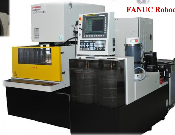
FANUC Robocut C600iA