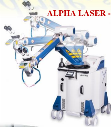
ALPHA LASER - ALM 200