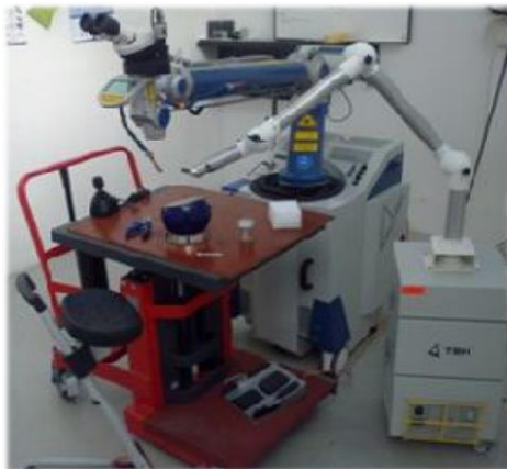
ALPHA LASER - ALM 200